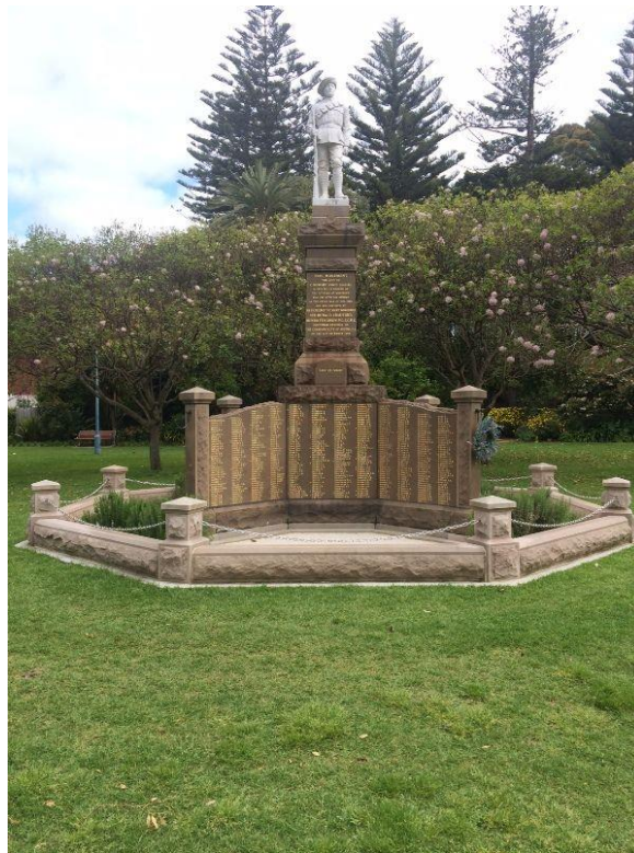
Waverley Park Soldiers’ Memorial